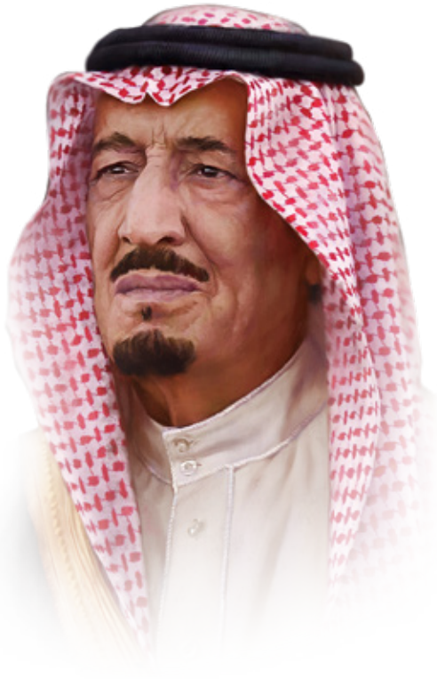
King Salman Bin Abdulaziz Al Saud Custodian of the Two Holy Mosques