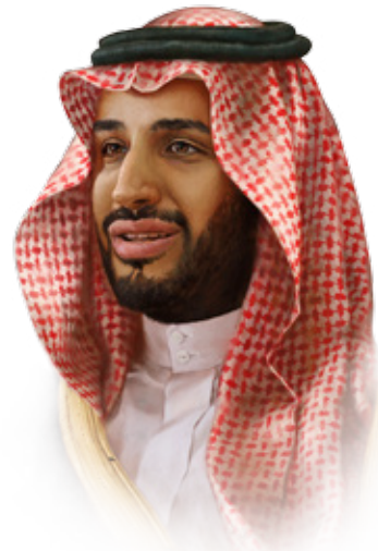
Prince Mohammed Bin Salman Bin Abdulaziz Al Saud Deputy Crown Prince, Second Deputy Prime Minister and Defence Minister