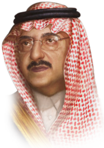
Prince Mohammed Bin Naif Bin Abdulaziz Al Saud Crown Prince, First Deputy Prime Minister and Minister of Interior